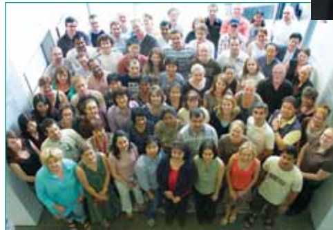
Brien Holden Vision Institute

We look forward to seeing you at these Awards Ceremonies to honor these distinguished individuals, acknowledging the countless contributions they have made in advancing our profession.