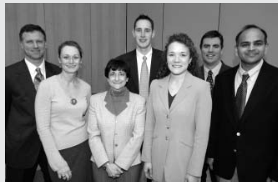
Names in bold indicate Ezell Club Members.